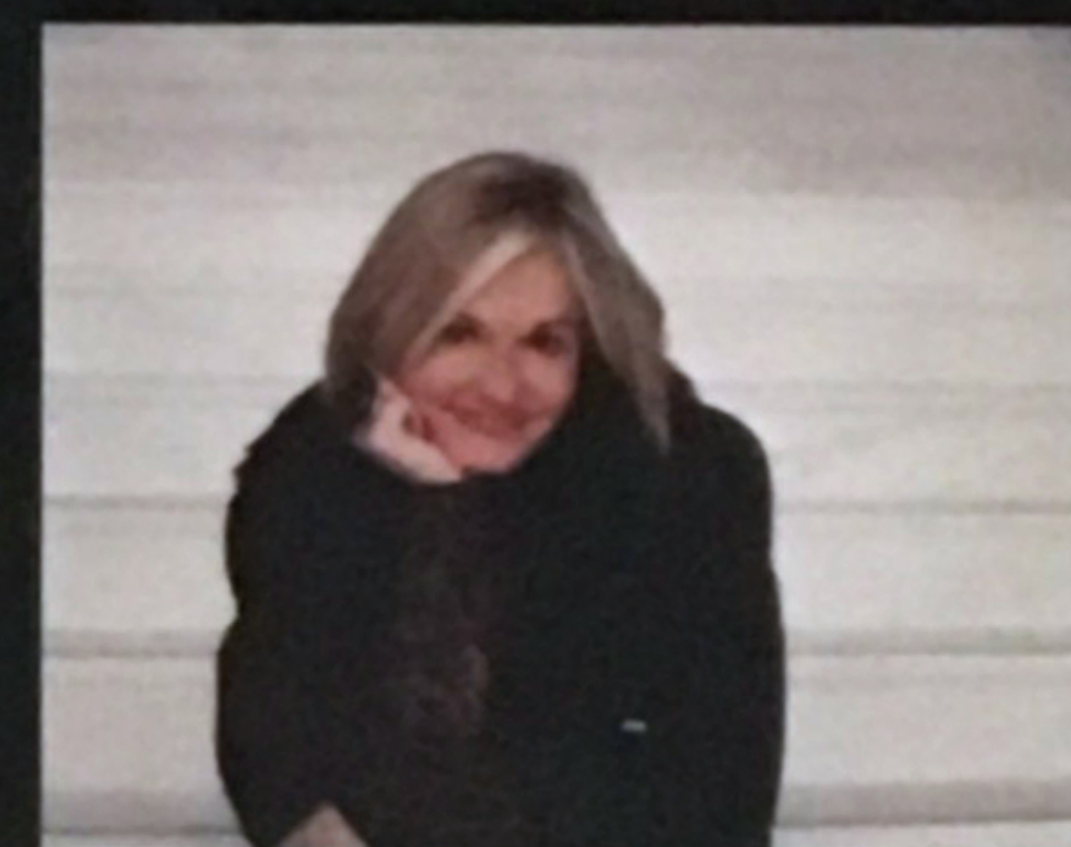
Schema 4 Architects