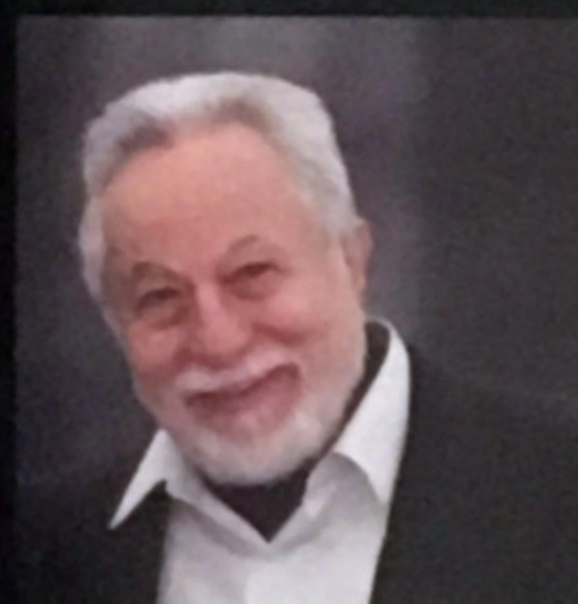
K.Kyriakides & Associates