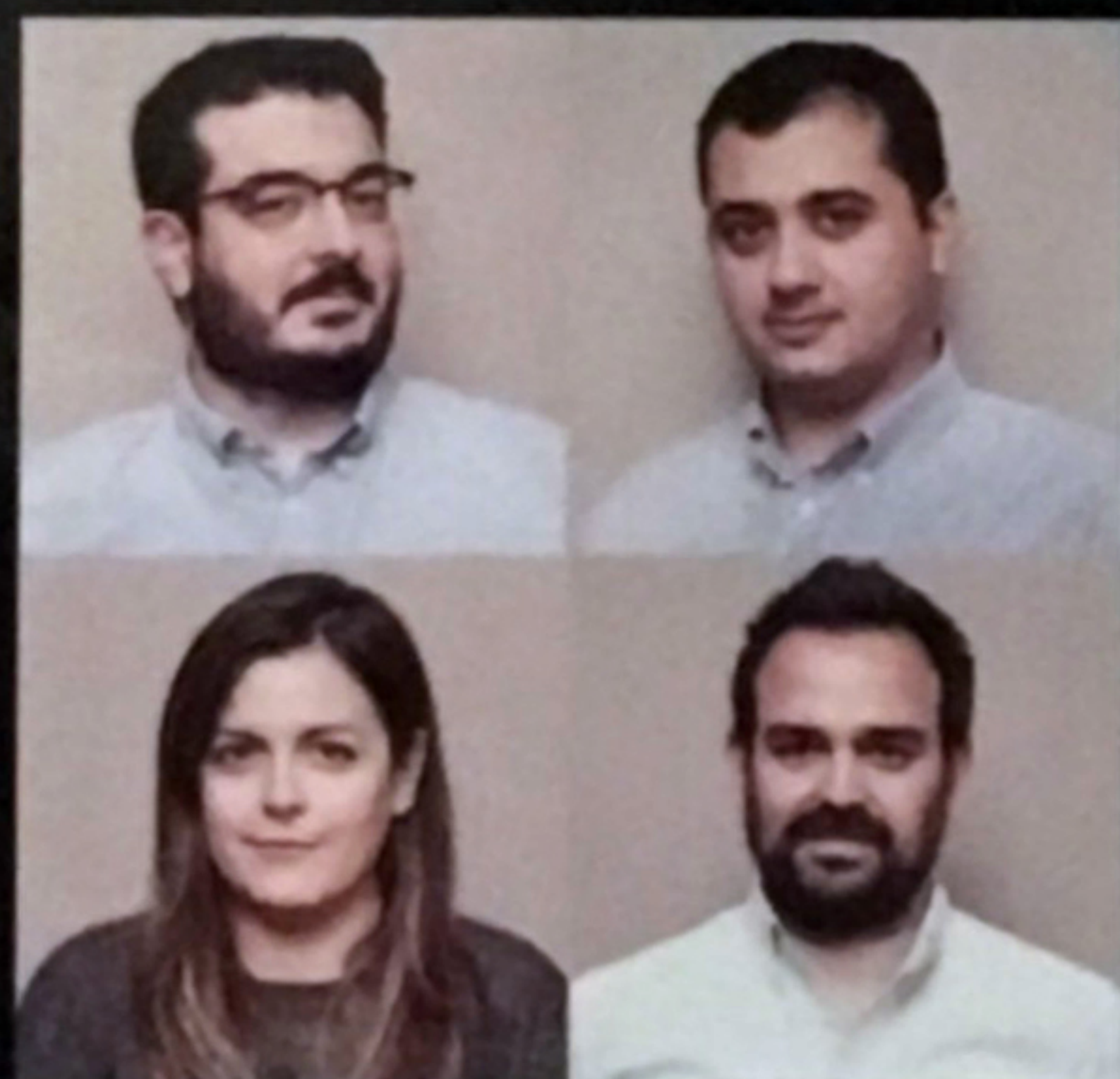
Urban Soul Project