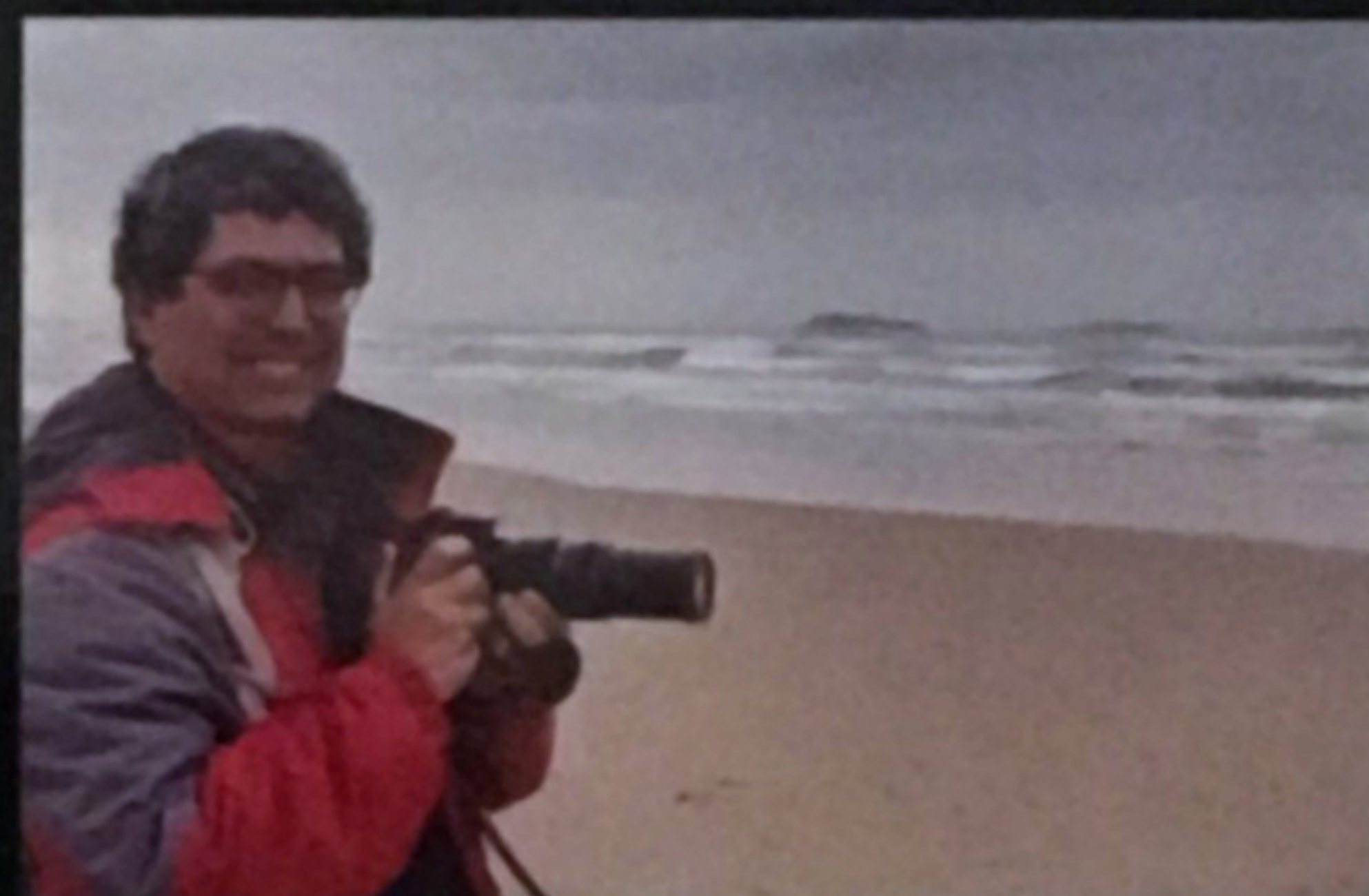
Alexandros N. Tombazis and Associates Architects